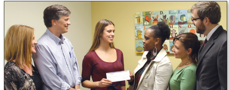
Caption to come.

> PACES Exchange & Visitation Center received a $25,000 recognition grant from the Kansas Health Foundation Leadership 2000 Class 27 also designated the center as the beneficiary of its fund-raising efforts.