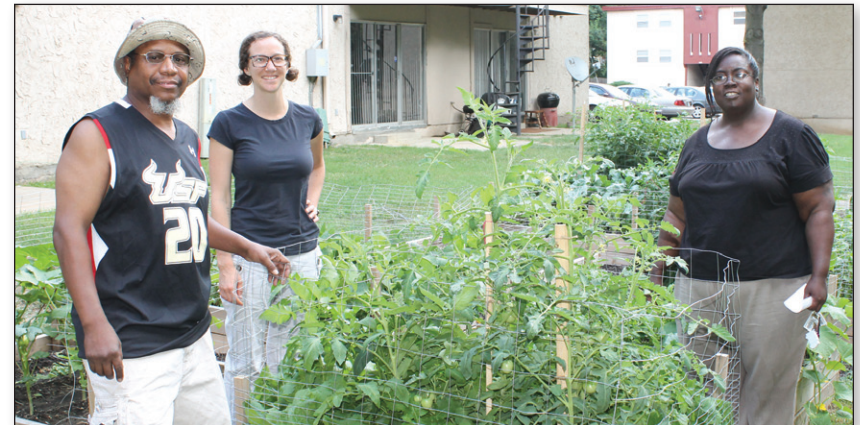
Caption to come.