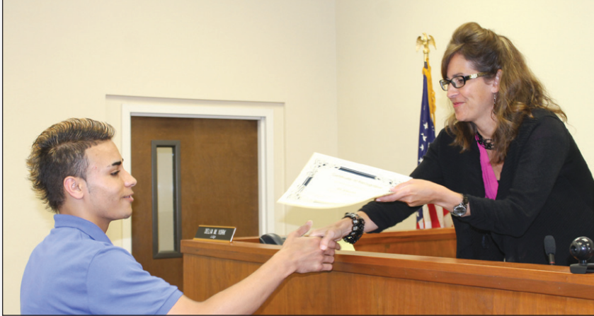
Caption to come.