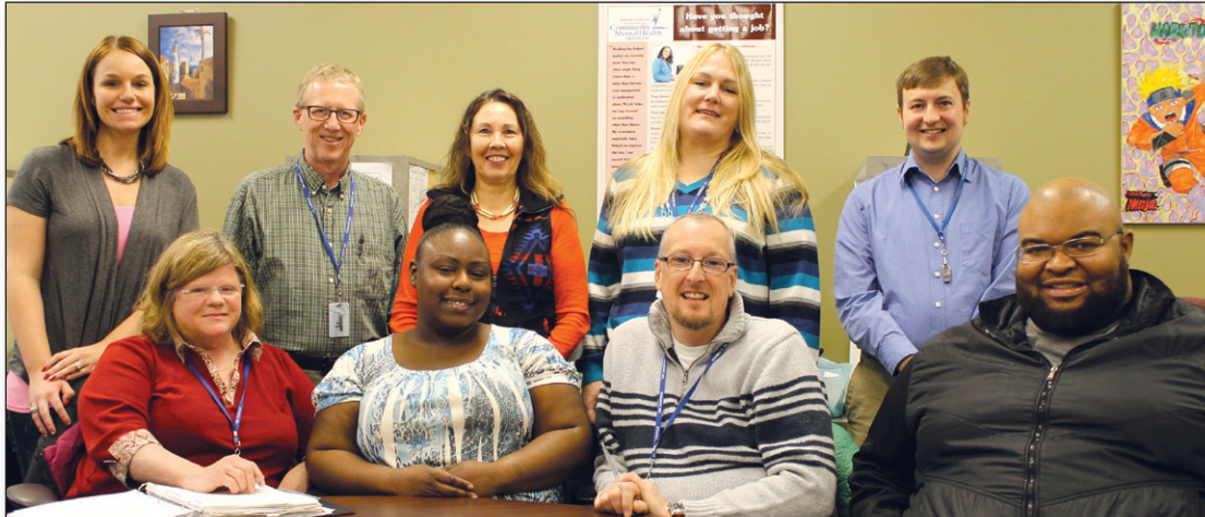
Caption to come.