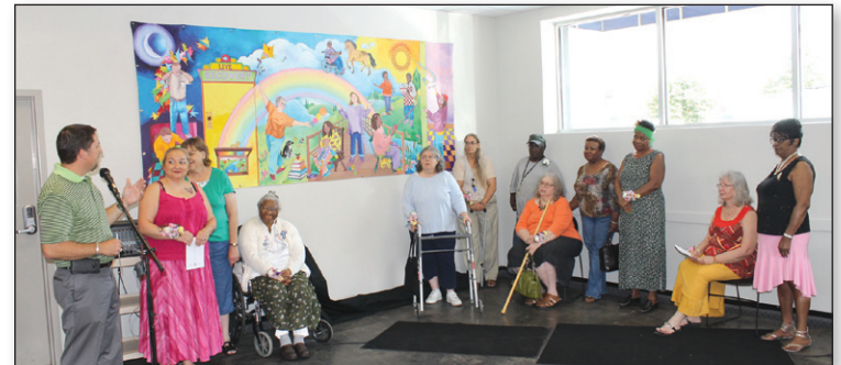
Caption to come.