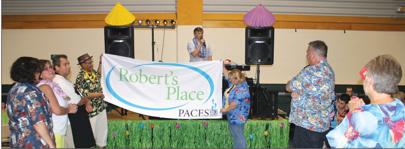
Caption to come.