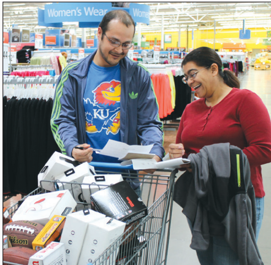
Caption to come.

> Wyandot Center received increased Tenant Based Rental Assistance funds in 2014 to provide rental subsidies, utility deposits and security deposits to income-eligible households. The center also received increases in all of its HUD funding that Kim Wilson Housing manages, which resulted in securing an additional two units to house consumers.