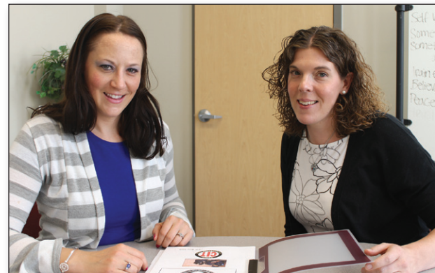
Caption to come.